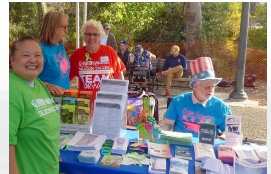
NAMI Santa Clara FaithNet

MHAP seeks to increase access to mental health support for our Korean population with limited English proficiency by increasing the pool of culturally competent mental health professionals.