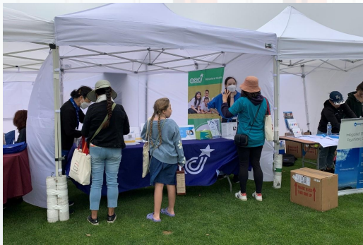
AACI Korean Information and Wellness Initiative (KIWI)

The pandemic has taken a significant toll on our collective mental health, and many are struggling to access the resources they need to cope with ongoing challenges. By providing funding for initiatives that prioritize access, we can break down barriers and ensure that everyone has the support they need to thrive.