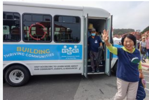
KCCEB Mental Health Asian Pipeline Program (MHAP)

AACI's KIWI program addresses the behavioral health needs of the Korean community through outreach and education to decrease stigma, as well as providing an innovative model of affordable behavioral health treatment.